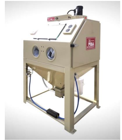
Shop Standard 2.0, 4836