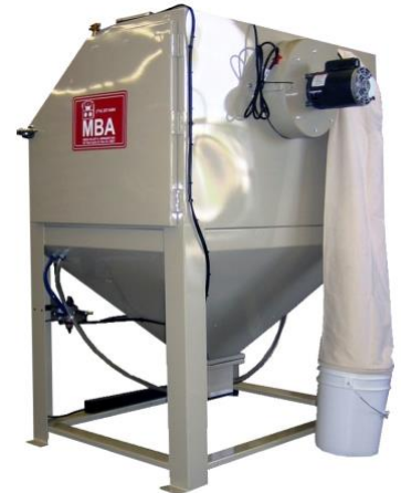
Larger Model 4836 shown with Optional 24" Window