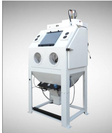
Shop Standard 2.0, 3628